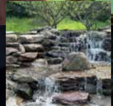
PG 22 AQUA DOC