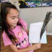
PG 4 THE LEARNING CAFE