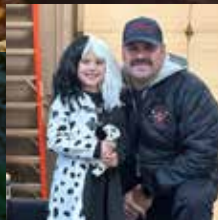
PG 12 THE VILLAGE OF MIDDLEFIELD