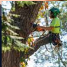
PG 8 INDEPENDENT TREE