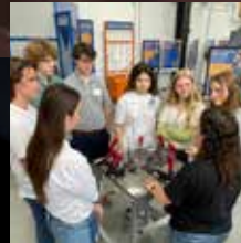
PG 14 MAGNET